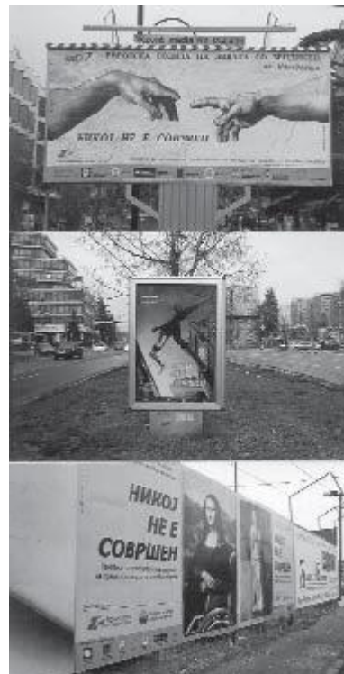
'Nobody's perfect' accessibility campaign and billboards

Polio Plus also did awareness-raising within the government: the formation of the Inter-Party Parliamentary Lobby Group (IPPLG) Polio Plus not only targets the public in their campaigns, they launched an awareness-raising initiative specifically targeted to the Macedonian parliament on the need to address disability issues on a state level . After successfully mobilising members of parliament, Polio Plus secured the commitment of 17 members of Parliament from different political parties to form the first inter-parliamentary lobby group in Macedonia based on disability rights. The goal of this group is improvement and promotion of the rights of persons with disability through lobbying . It will focus on disability rights and the introduction of a Disability Discrimination Act , a legal instrument that will lie 'Nobody's Perfect' accessibility campaign poster and billboards across the whole of the legislature and serve as the reference point for disability issues.